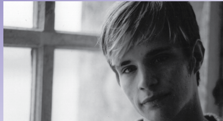
Matthew Shepard